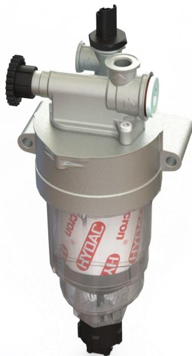
HDP 240 BC – pre-filter